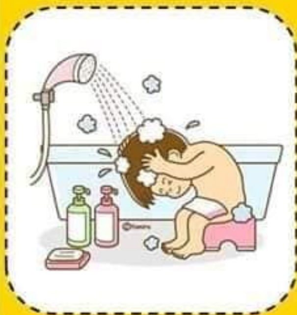
Take a shower